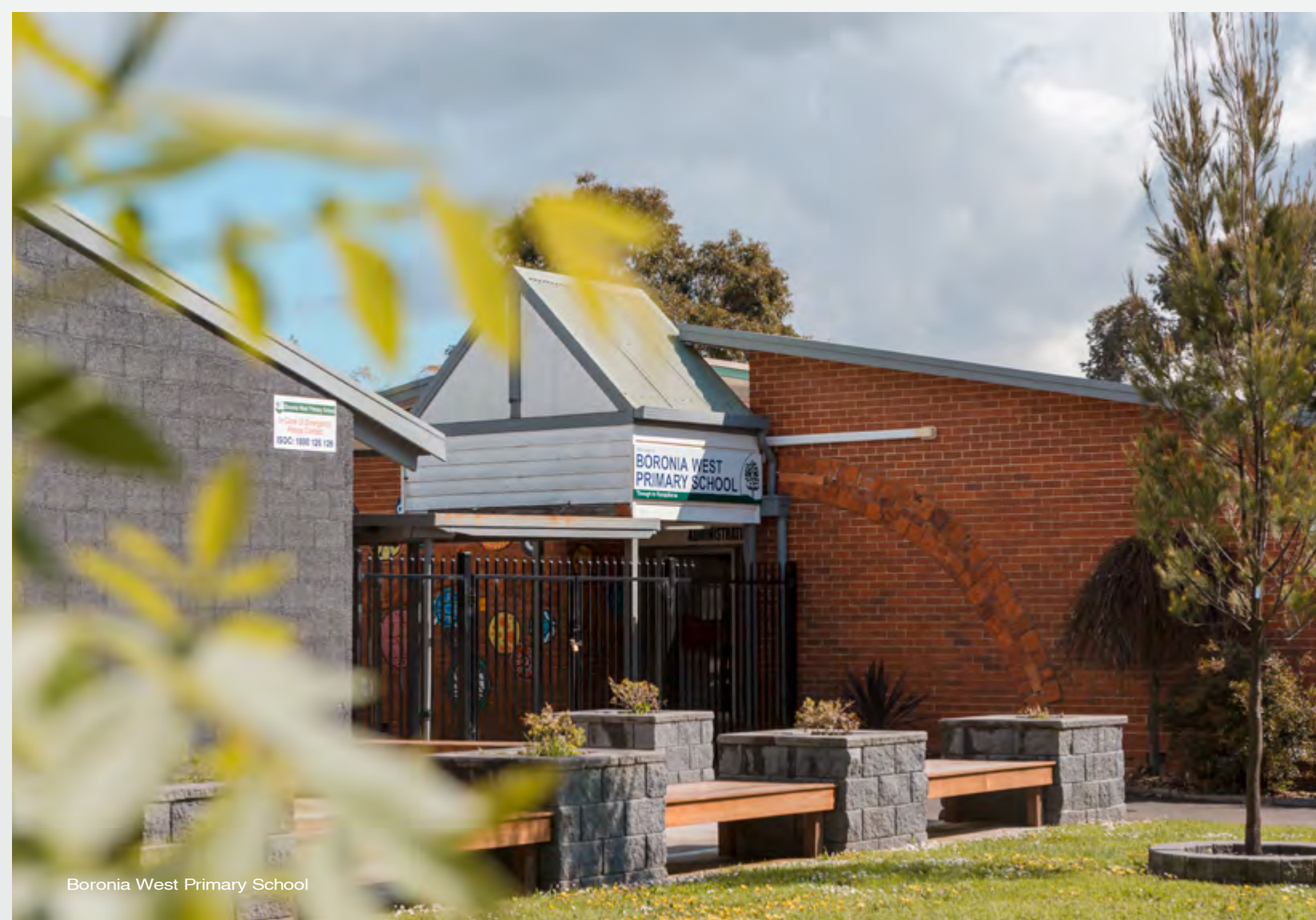
Boronia West Primary School

Boronia Library is just around the corner with a variety of community events catered to families and children.