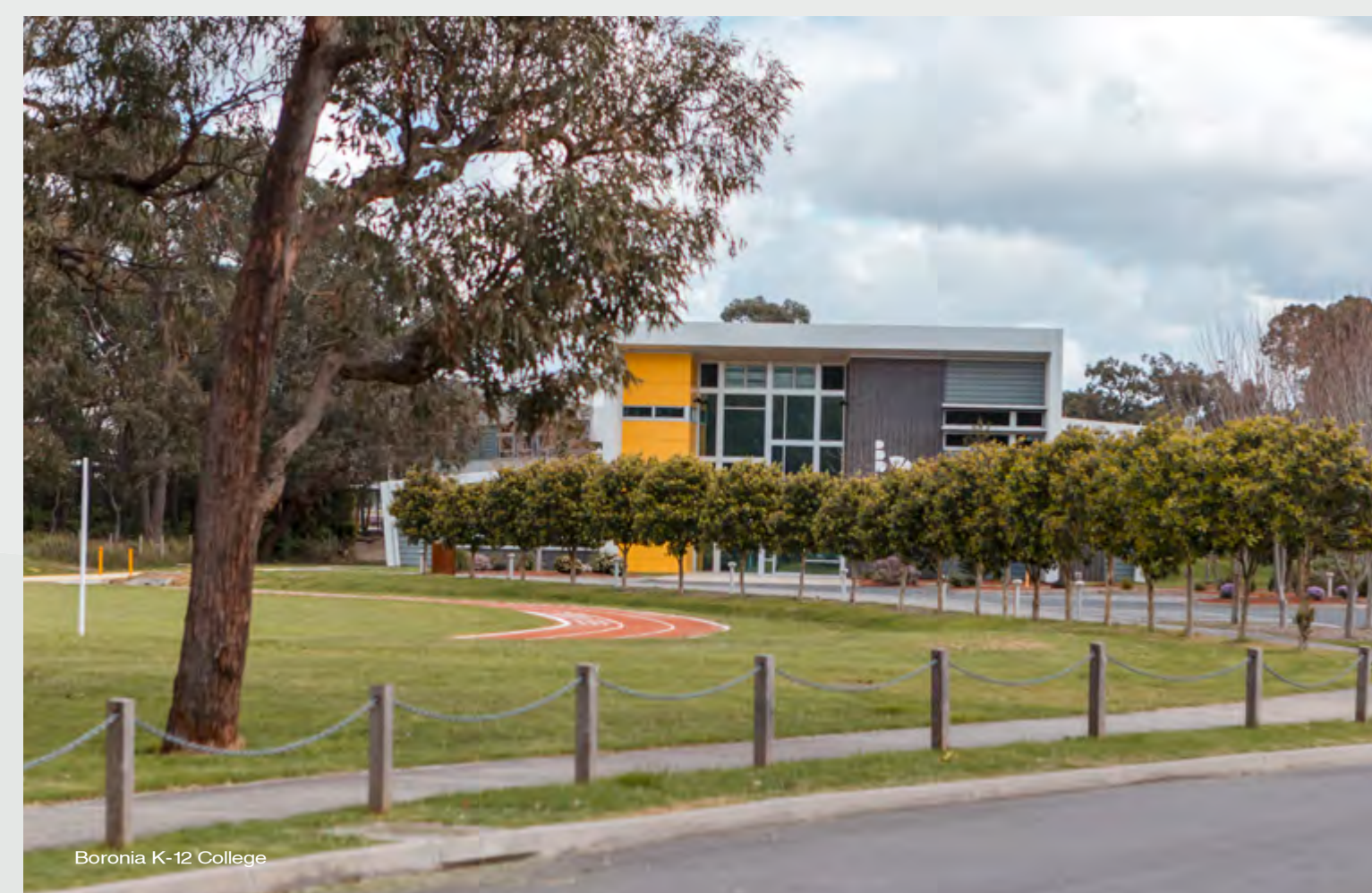
Boronia K-12 College