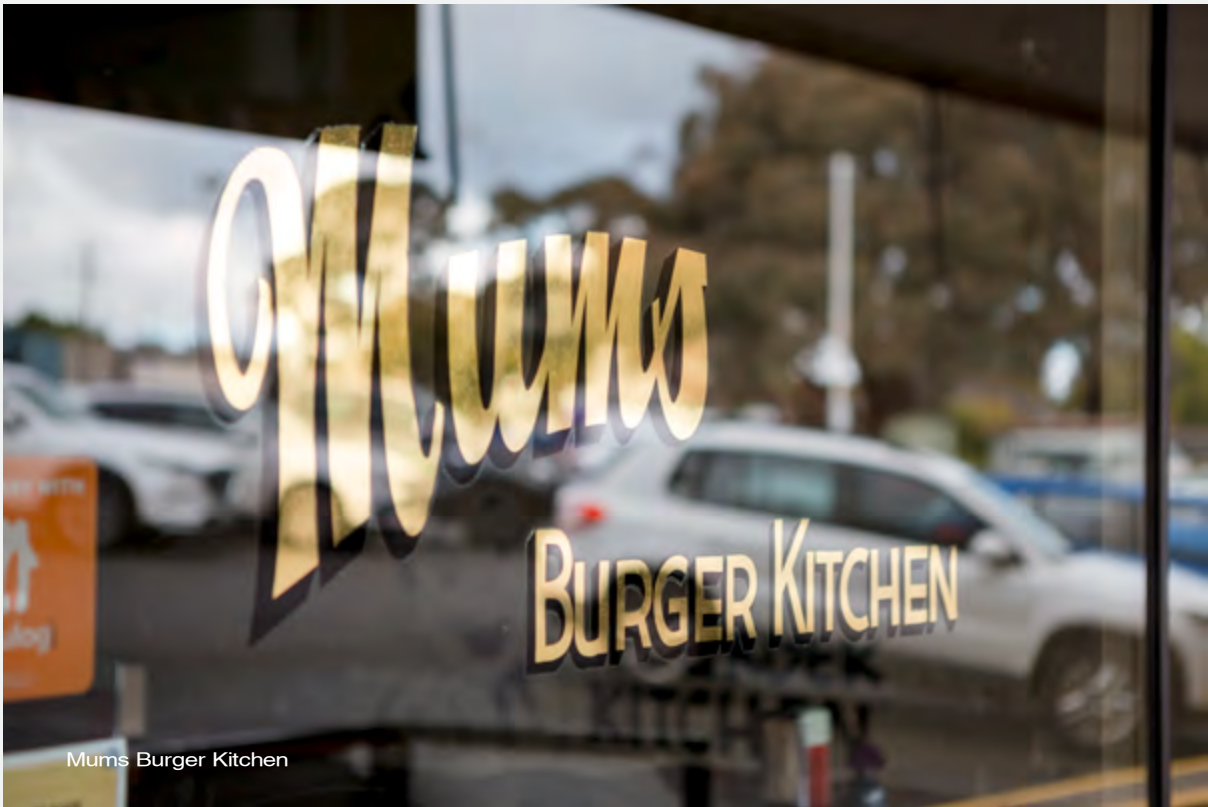
Mums Burger Kitchen