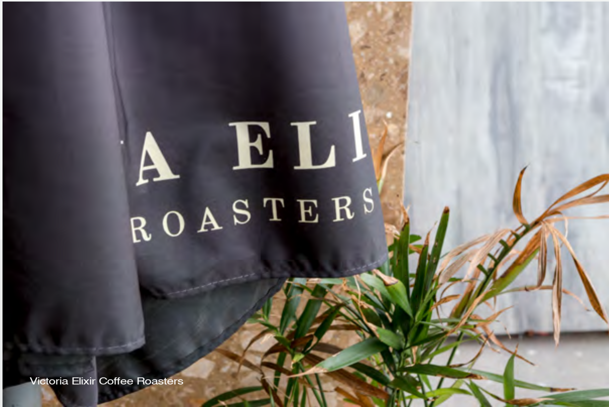
Victoria Elixir Coffee Roasters