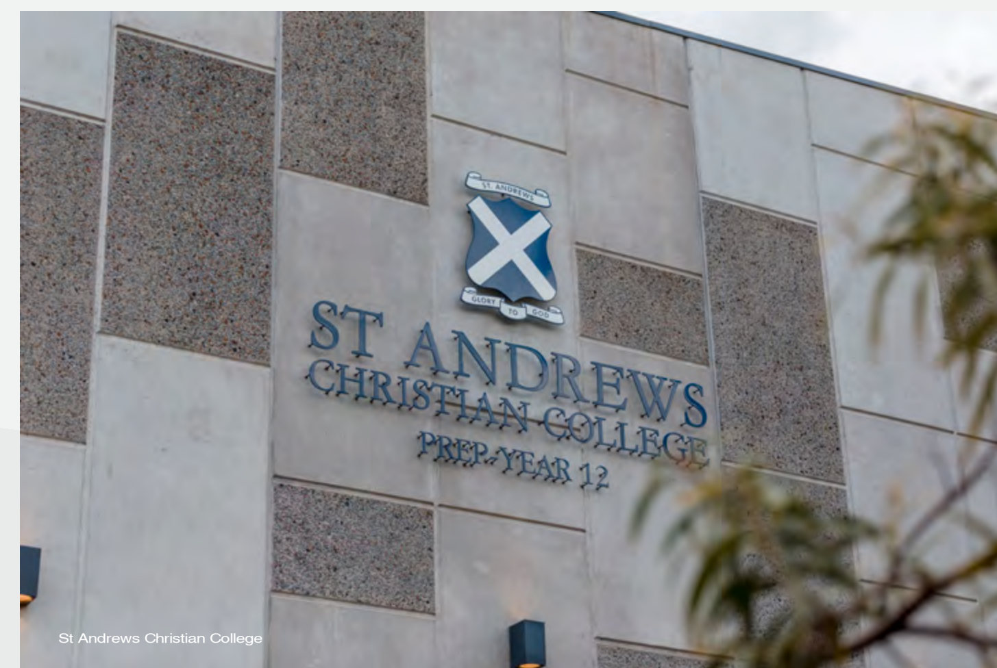
St Andrews Christian College