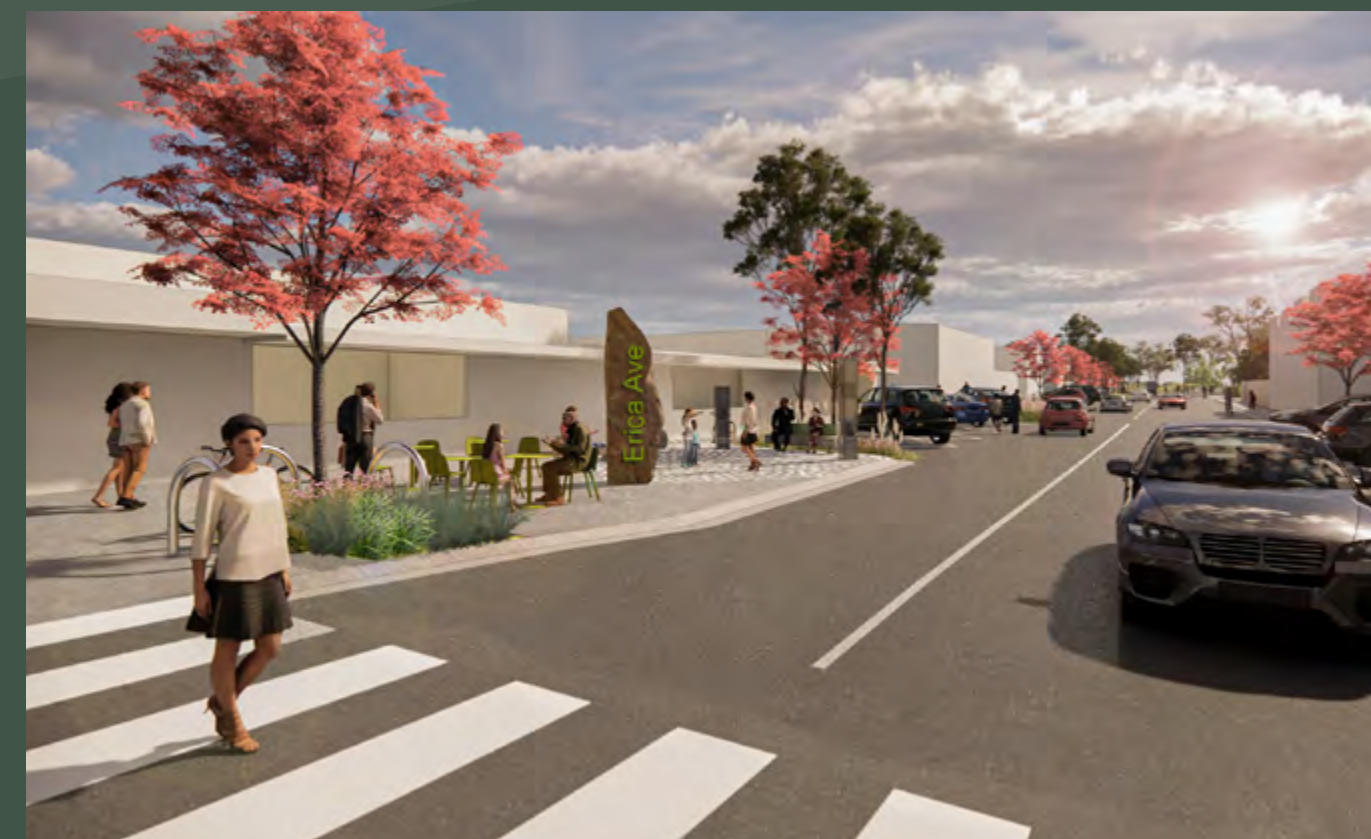
Erica Avenue Streetscape Renewal Project