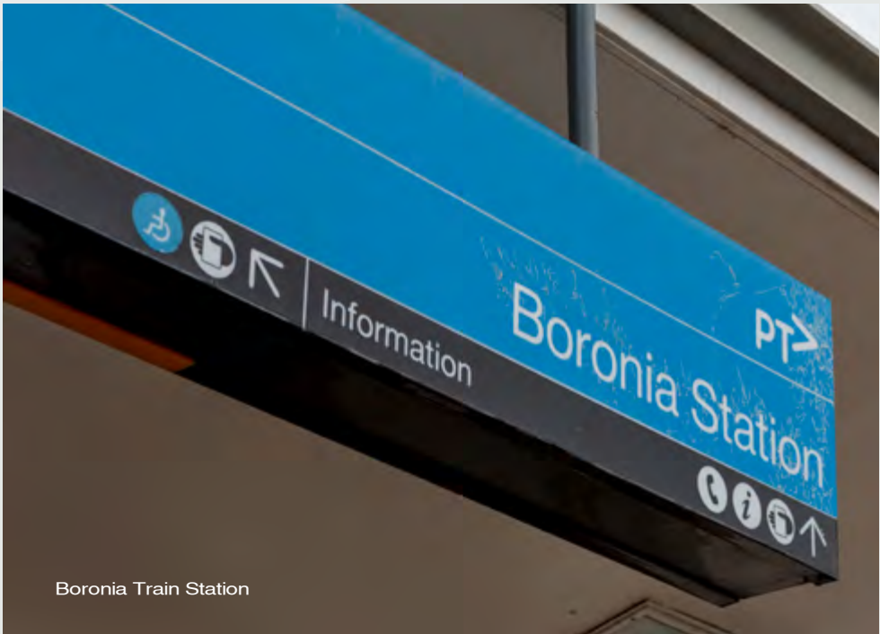
Boronia Train Station