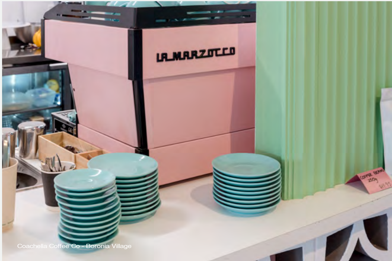
Coachella Coffee Co - Boronia Village