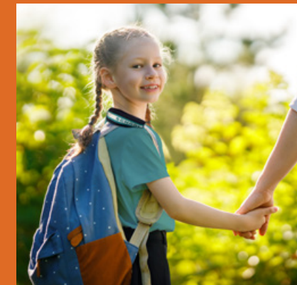
Woodlinks Primary School