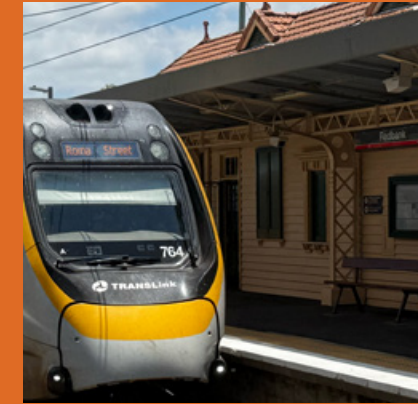
Redbank Train Station