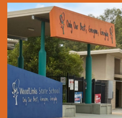
Woodlinks Primary School