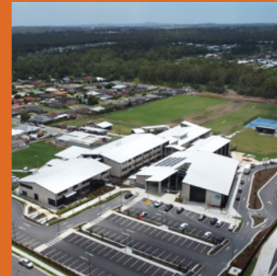
Collingwood Park State Secondary College