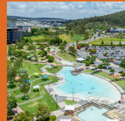
Orion Lagoon, Springfield