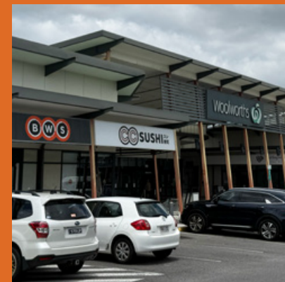
Collingwood Park Shopping