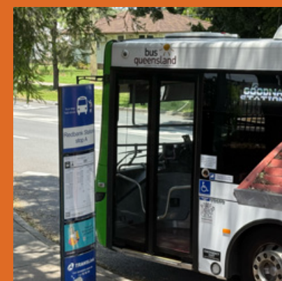
Convenient Bus Network